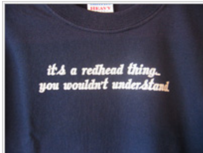
It's a redhead thing... Youth Tee (Navy) - $10.99

Those of us blessed with fiery locks will relate to this funny t-shirt, which states "It's a redhead thing... you wouldn't understand." One of our oldest and most well-known tee shirts, what other quote sums up all our cool little quirks so efficiently? Youth Sizing Information: XS... More Info