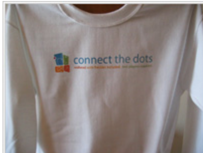
Connect the Dots Sweatshirt (White) - $18.99

It's no big secret that freckles are sexy (and can be fun, too!) Poke a little fun at yours with this funny sweatshirt that says "connect the dots" across the front, with "redhead with freckles included. two players required." printed underneath in bright colors. The sweatshirt... More Info