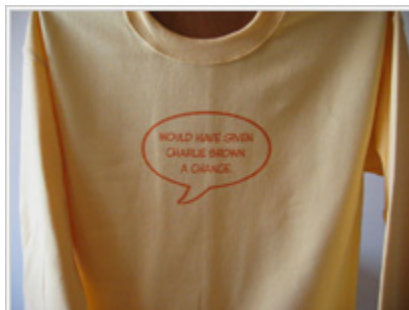
Would Have Given Charlie Brown a Chance Sweatshirt - $19.99

It's no big secret that freckles are sexy (and can be fun, too!) Poke a little fun at yours with this funny design that says "connect the dots" across the front, with "redhead with freckles included. two players required." printed underneath in bright colors. More Info