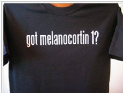
Got Melanocortin 1? Tee (Black) - $15.99

Not all redheads hate their freckles. For those of us who think they are pretty damn cute, this tee is sure to bring a few smiles your way. Printed on a color called "Blue Dusk", it's a rich, medium blue that will flatter any redhead's coloring. It's not as harsh as traditional navy. The... More Info