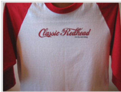
Classic Redhead 3/4 Sleeve Baseball Tee - $16.99

Realm of Redheads Store » Browse by Category » 3/4 Sleeve Baseball Tees