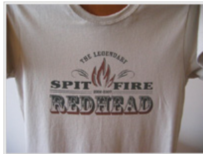
Legendary Spitfire Redhead Women's Relaxed Fit Tee - $15.99

Realm of Redheads Store » Browse by Category » Women's Tees » Relaxed Fit Women's Tees