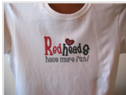
Redheads Have More Fun Women's Relaxed Fit Tee - $13.99

Free-spirited redheads are going to love this beautifully detailed winged heart design on a white tee. The banner across the design reads "Redhead Gone Wild." Zoom image to see a more detailed view. More Info