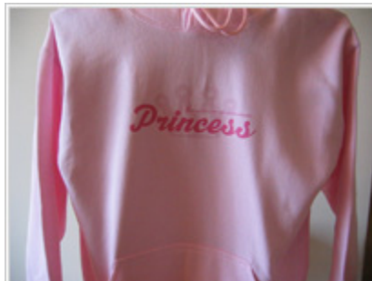
Redheaded Princess Hoodie - $21.99

These hooded sweatshirts are sure to draw a few laughs when they see "Classic Redhead" spanning the chest, with the tag line "I'm the real thing." underneath of it. Perfect for natural redheads tired of being asked whether their hair is real or not. The back is blank. More Info