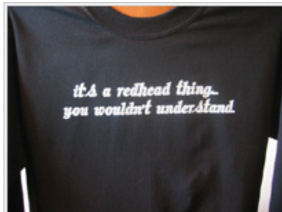
It's a Redhead Thing... Long Sleeve Tee - $17.99

It's no big secret that freckles are sexy (and can be fun, too!) Poke a little fun at yours with this funny tee that says "connect the dots" across the front, with "redhead with freckles included. two players required." printed underneath in bright colors. Prepare to have compl... More Info