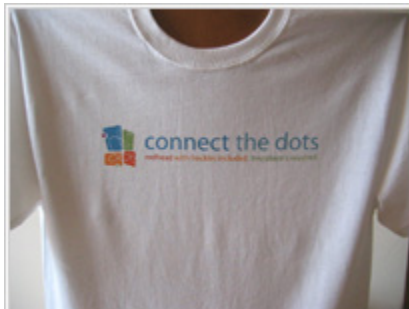
Connect the Dots Tee (White) - $13.99

It's no big secret that freckles are sexy (and can be fun, too!) Poke a little fun at yours with this funny tee that says "connect the dots" across the front, with "redhead with freckles included. two players required." printed underneath in bright colors. Prepare to have compl... More