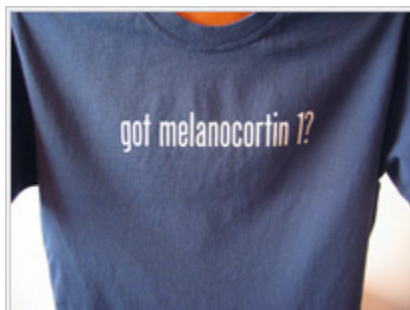
Got Melanocortin 1? Tee (Blue Dusk) - $15.99