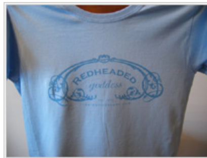
Redheaded Goddess Women's Relaxed Fit Tee - $15.99

"The Legendary Spit Fire Redhead" is back by popular demand! Designed to look like an antique Old Western sign, these shirts were printed on a neutral pebble/light tan color. Under the fire symbol are the dates 2006-2007. Ink colors are antique black and brownish red. The back is blank. More Info