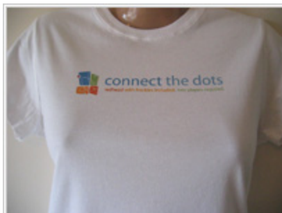
Connect the Dots Babydoll Tee (White) - $15.99

It's no big secret that freckles are sexy (and can be fun, too!) Poke a little fun at yours with this funny tee that says "connect the dots" across the front, with "redhead with freckles included. two players required." printed underneath in bright colors. Prepare to have compl... More