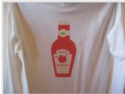
Saucy Redhead Long Sleeve Tee (White) - $16.99

This design made us laugh so hard we could barely contain ourselves. This clever tee is printed on both sides. It has a funny little tomato on the front left chest, and the back has an upright ketchup bottle with the words "Saucy Redhead" surrounding it. Underneath it says "Hot & S..." More Info