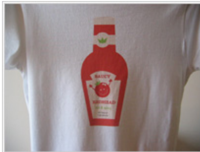
Saucy Redhead Tee (White) - $14.99

This design made us laugh so hard we could barely contain ourselves. This clever tee is printed on both sides. It has a funny little tomato on the front left chest, and the back has an upright ketchup bottle with the words "Saucy Redhead" surrounding it. Underneath it says "Hot & S... More Info