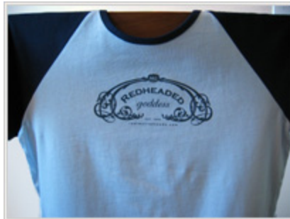
Redheaded Goddess Baseball Baby Doll Tee - $17.99

These baby doll tees are a pale, stone blue with a subtle, duo-tone design in a slightly darker blue. A classy way for redheads to flaunt what they've got. The design on the shirt contains the words Redheaded Goddess. Underneath the design, the words read "Est. 1998" and "realmofredheads.com". The ... More Info