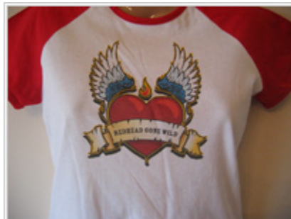
Redhead Gone Wild! Baseball Baby Doll Tee - $17.99

Free-spirited redheads are going to love this beautifully detailed winged heart design on a white babydoll tee. The banner across the design reads "Redhead Gone Wild." Zoom image to see a more detailed view. More Info