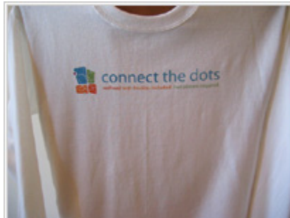
Connect the Dots Long Sleeve Tee (White) - $16.99

This design made us laugh so hard we could barely contain ourselves. This clever tee is printed on both sides. It has a funny little tomato on the front left chest, and the back has an upright ketchup bottle with the words "Saucy Redhead" surrounding it. Underneath it says "Hot & S..." More Info