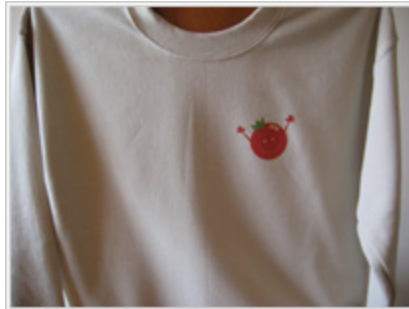
Saucy Redhead Sweatshirt (Sand) - $19.99

Realm of Redheads Store » Browse by Category » Sweatshirts