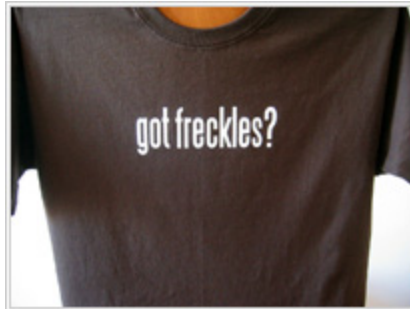
Got Freckles? Tee Dark Chocolate - $15.99

Realm of Redheads Store » Browse by Category » Tee Shirts