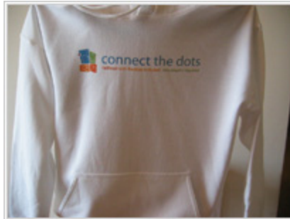
Connect the Dots Hoodie (White) - $21.99

Realm of Redheads Store » Browse by Category » Hoodies