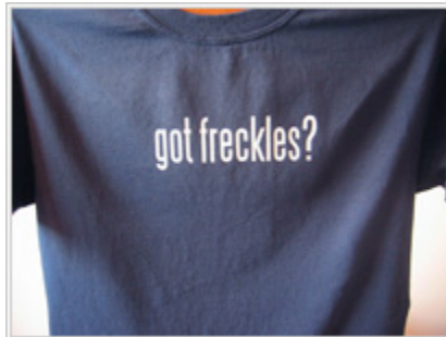
Got Freckles? Tee (Navy) - $15.99

Those of us blessed with fiery locks will relate to this funny t-shirt, which states "It's a redhead thing... you wouldn't understand." One of our oldest and most well-known tee shirts, what other quote sums up all our cool little quirks so efficiently? Printed on a beautiful dark chocol... More Info