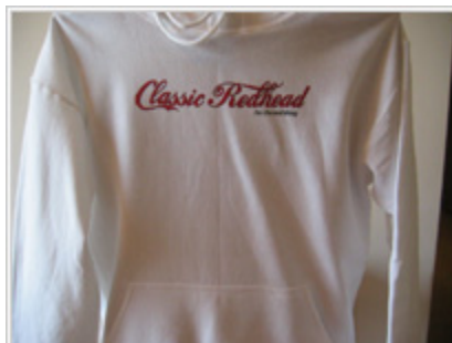
Classic Redhead Hoodie - $21.99

These hooded sweatshirts are sure to draw a few laughs when they see "Classic Redhead" spanning the chest, with the tag line "I'm the real thing." underneath of it. Perfect for natural redheads tired of being asked whether their hair is real or not. The back is blank. More Info