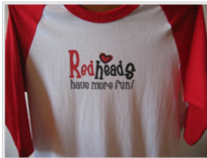
Redheads Have More Fun 3/4 Sleeve Baseball Tee - $16.99

Who says blondes have more fun?! This flirty little design boldly argues that redheads have the market cornered on that front. Also available in a retro martini design. More