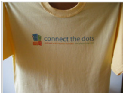
Connect the Dots Tee (Yellow Haze) - $15.99

This design made us laugh so hard we could barely contain ourselves. This clever tee is printed on both sides. It has a funny little tomato on the front left chest, and the back has an upright ketchup bottle with the words "Saucy Redhead" surrounding it. Underneath it says "Hot & S... More Info