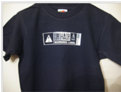
Consider the Hair a Warning Label Youth Tee - $10.99

Those of us blessed with fiery locks will relate to this funny t-shirt, which states "It's a redhead thing... you wouldn't understand." One of our oldest and most well-known tee shirts, what other quote sums up all our cool little quirks so efficiently? Youth Sizing Information: XS... More Info