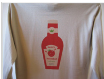
Saucy Redhead Long Sleeve Tee (Sand) - $17.99

Realm of Redheads Store » Browse by Category » Long Sleeve Tees