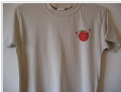
Saucy Redhead Youth Tee (Sand) - $10.99

Realm of Redheads Store » Browse by Category » Youth Tees