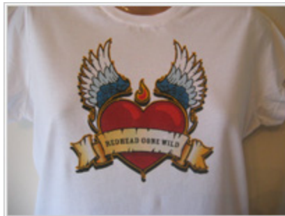
Redhead Gone Wild! Women's Babydoll Tee (White) - $15.99

If you are a redheaded goddess, you'll look great in this frost blue sky ladies' lightweight jersey knit raglan baby doll tee with navy sleeves. The design on the shirt contains the words Redheaded Goddess. Underneath the design, the words read "Est. 1998" and "realmofredheads.com". The back is bl... More Info