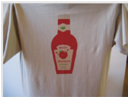
Saucy Redhead Tee (Sand) - $15.99

Realm of Redheads Store » Browse by Category » Tee Shirts