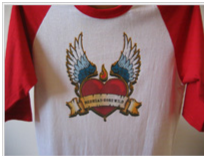
Redhead Gone Wild! 3/4 Sleeve Baseball Tee - $16.99

Free-spirited redheads are going to love this beautifully detailed winged heart design on a 3/4 sleeve raglan baseball tee. The banner across the design reads "Redhead Gone Wild." Zoom image to see a more detailed view. More Info