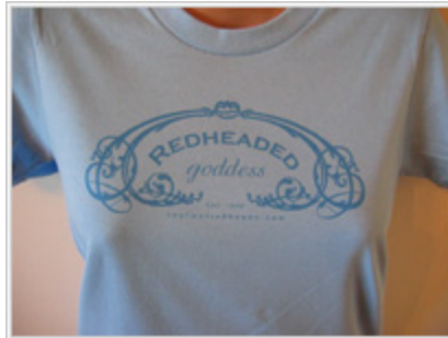
Redheaded Goddess Baby Doll Tee - $17.99

Realm of Redheads Store » Browse by Category » Women's Tees » Slim Fit Women's Tees