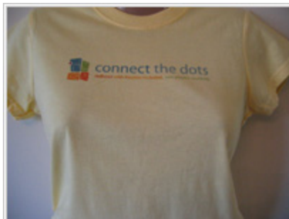
Connect the Dots Babydoll Tee (Yellow Haze) - $17.99

Slim Fit Women's Tees (also referred to as baby dolls), are lightweight and made of super soft 100% combed ringspun cotton. They are not very stretchy, and are cut VERY small, so choose your size carefully. You may want to order one size larger than you normally wear, because the baby doll tee in size large is physically smaller than a regular unisex tee in size small.