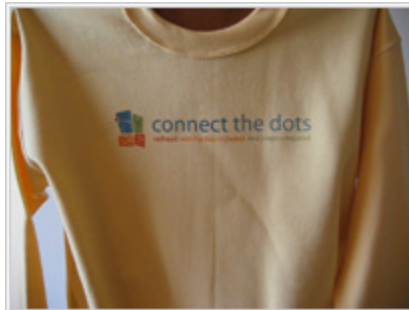
Connect the Dots Sweatshirt (Yellow Haze) - $19.99

This design made us laugh so hard we could barely contain ourselves. This clever sweatshirt is printed on both sides. It has a funny little tomato on the front left chest, and the back has an upright ketchup bottle with the words "Saucy Redhead" surrounding it. Underneath it says "... More Info