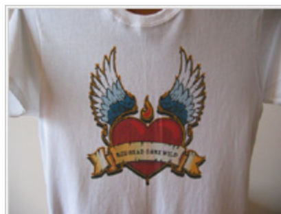
Redhead Gone Wild! Women's Relaxed Fit Tee (White) - $15.99

These light blue tee shirts with a subtle, duo-tone design in a slightly darker blue are a classy way for redheads to flaunt what they've got. The design on the shirt contains the words Redheaded Goddess. Underneath the design, the words read "Est. 1998" and "realmofredheads.com". The back is blank. More Info