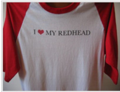
I Love My Redhead 3/4 Sleeve Baseball Tee - $16.99

What's almost as cool as a redhead? The people who love them. A shirt like this has been one of the most requested items EVER. Finally, you can pay homage to the redhead in your life with this funny 3/4 sleeve raglan baseball tee. The back is blank. More Info