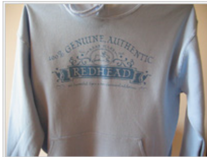
100% Genuine Redhead Hoodie (Light Blue) - $21.99

It's no big secret that freckles are sexy (and can be fun, too!) Poke a little fun at yours with this funny design that says "connect the dots" across the front, with "redhead with freckles included. two players required." printed underneath in bright colors. More Info